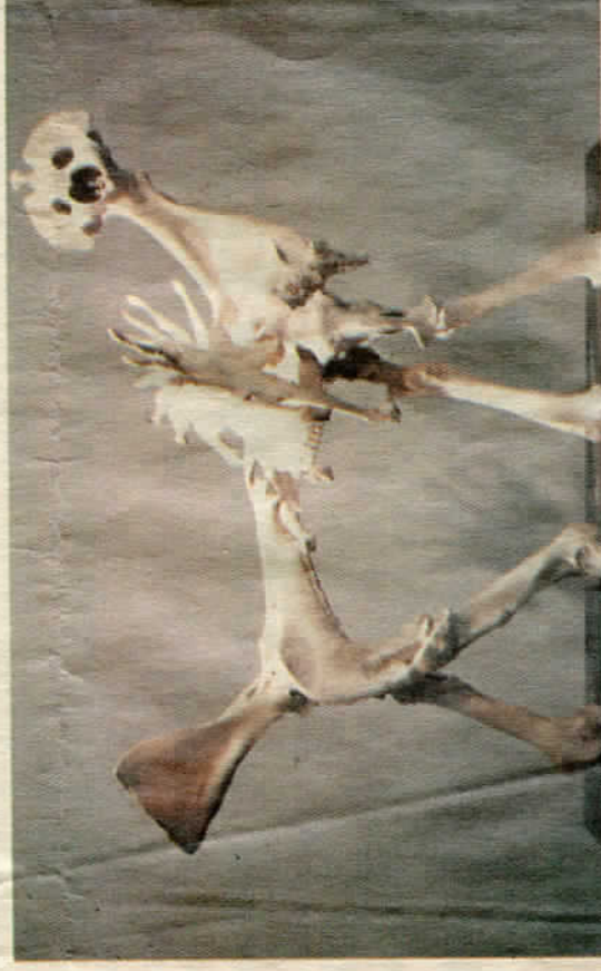
Joseph Wheelwright's "Griffin," made from actual bones, prances grandly, in high humor.

The exhibit reveals that although these demons often draw their power from anxiety, they nonetheless are also able to